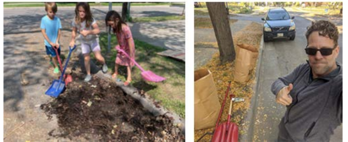
New participants and drains adopted in Fridley, 2021